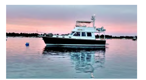
Eventide - Dick & Robin Woods